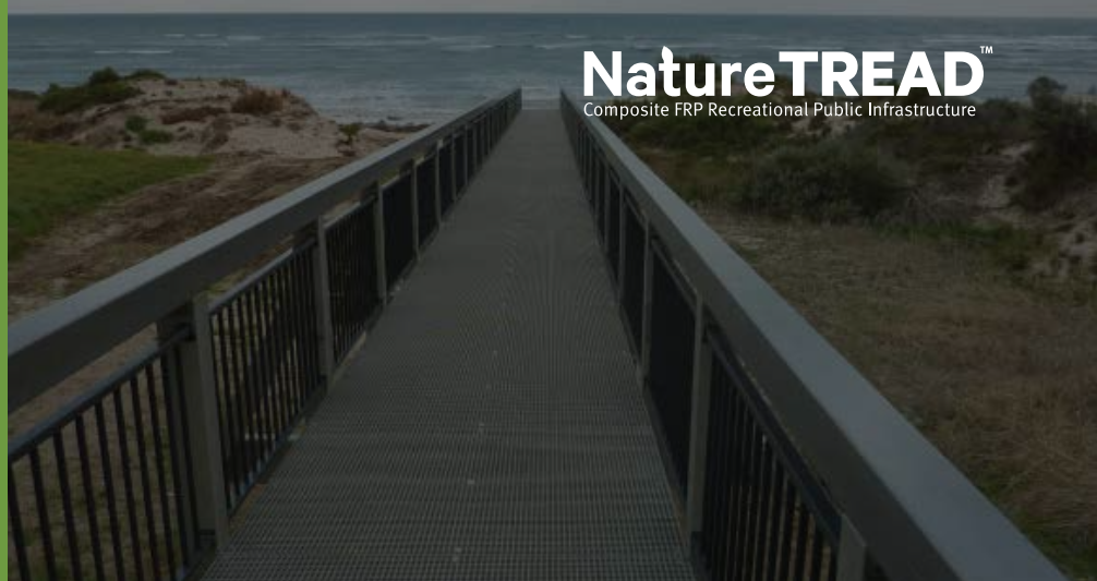
NatureTREAD™ Composite FRP Recreational Public Infrastructure

For the Recreational Public Infrastructure in the urban space, Treadwell offers the complete range of engineered FRP products to suit this particular scope of works.