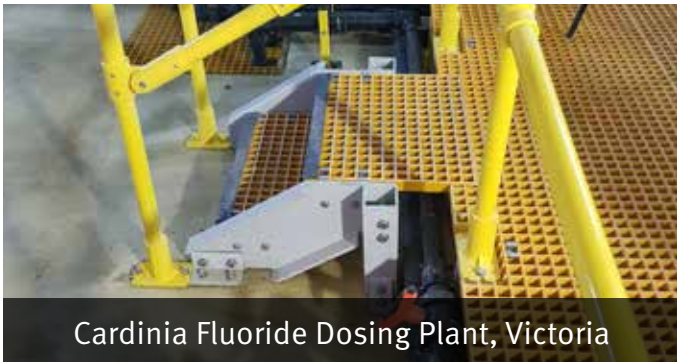
Cardinia Fluoride Dosing Plant, Victoria

The Myponga Reserve is a reservoir in South Australia about 60km south of Adelaide. It provides about 5% of the City of Adelaide's water supply. As part of the rejuvenation of access for personnel to maintain the pipeline, SA Water deemed the deteriorated and unsafe wooden walkway needed to be replaced.