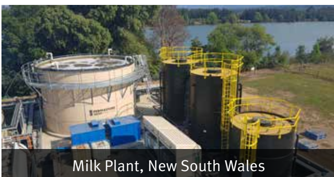
Milk Plant, New South Wales

Our client undertook a complete mechanical plant design for a milk plant in New South Wales. This included three large tanks with top access safety platforms; this was to allow for easy installation and removal of large aerator mixers. Their design included ladders and ladder cages to provide safety to personnel using the roof mounted manhole access. These ladders also needed to be lockable to prevent non-permitted access.