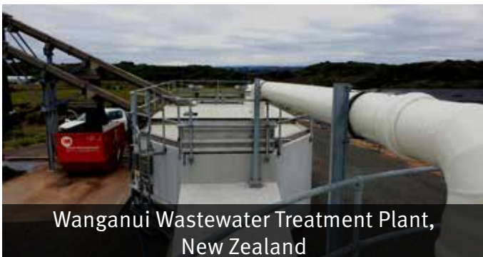
Wanganui Wastewater Treatment Plant, New Zealand

The iron ore production facility in Port Latta is one of Australia's largest and has been serving global markets for many decades. Set to increase its annual production of iron pellets in the coming years, this production plant is not slowing down.