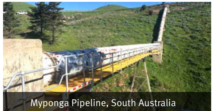
Myponga Pipeline, South Australia

Treadwell was engaged to supply the grating to replace this wooden walkway.