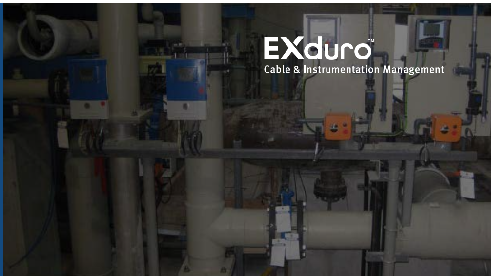
EXduro™ Cable & Instrumentation Management

Treadwell offers an assortment of cable instrumentation systems based on the latest technology with the EXduro™ range. EXduro™ encompasses fibreglass cable trays, instrumentation stands & FRP support accessories.