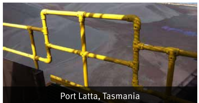
Port Latta, Tasmania

To ensure the safety of their workers, Treadwell was engaged to provide safe access in the production facility. Keeping in mind the projected high levels of productivity, it was specified that the products used would be quick to install and would not require regular downtime for maintenance.