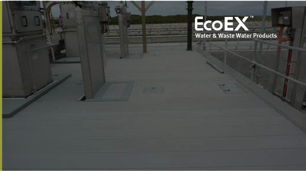
EcoEX™ Water & Waste Water Products

We believe that water and waste water management is crucial for society. By using the latest FRP technology, we have developed EcoEX™ to treat these resources right.